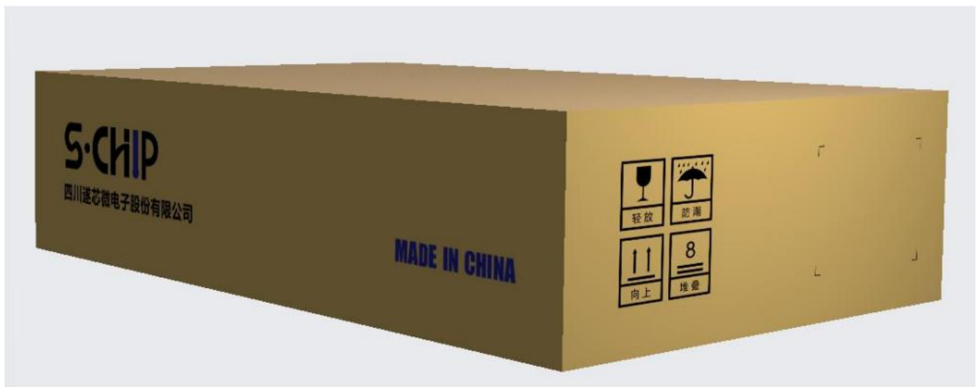
Fig.1- Tube pack for QC3Q